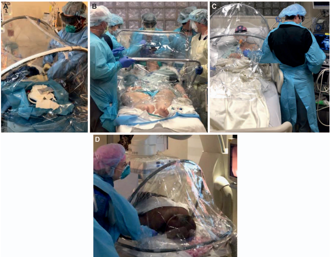
Figure Schematic of the negative pressure procedural tent device. A) Patient undergoing tracheostomy in the intensive care unit; B) patient undergoing endotracheal intubation in the ED; C) patient on non-invasive ventilation undergoing point-of-care ultrasound in the ED; D) patient undergoing endoscopic retrograde cholangiopancreatography in procedure suite. Photos used with permission after obtaining informed verbal consent from patients or family members. ED = Emergency Department.